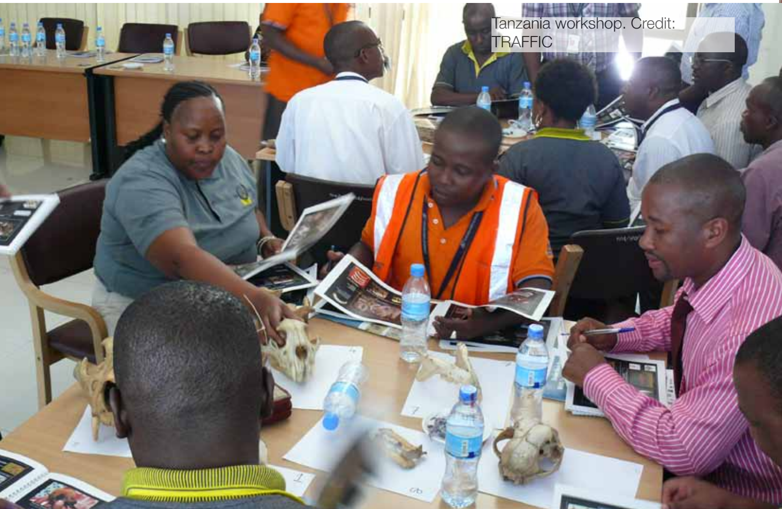
Tanzania workshop.