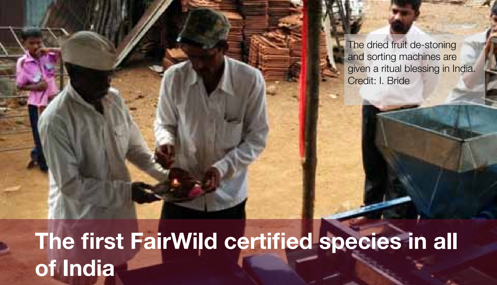
The dried fruit de-stoning and sorting machines are given a ritual blessing in India.