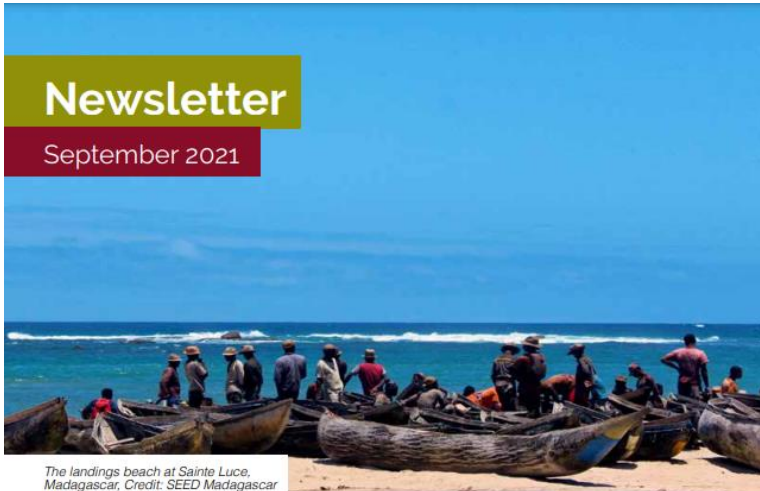
The landings beach at Sainte Luce, Madagascar.