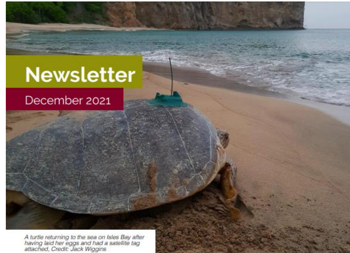
A turtle returning to the sea on Isles Bay after having laid her eggs and had a satellite tag attached.