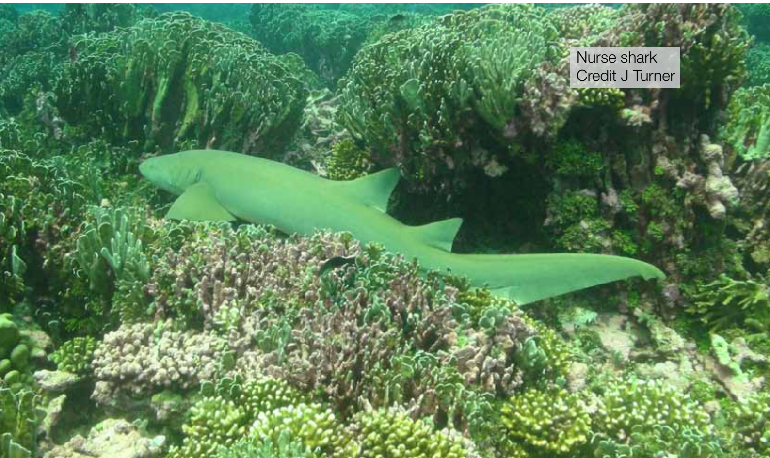
Nurse shark