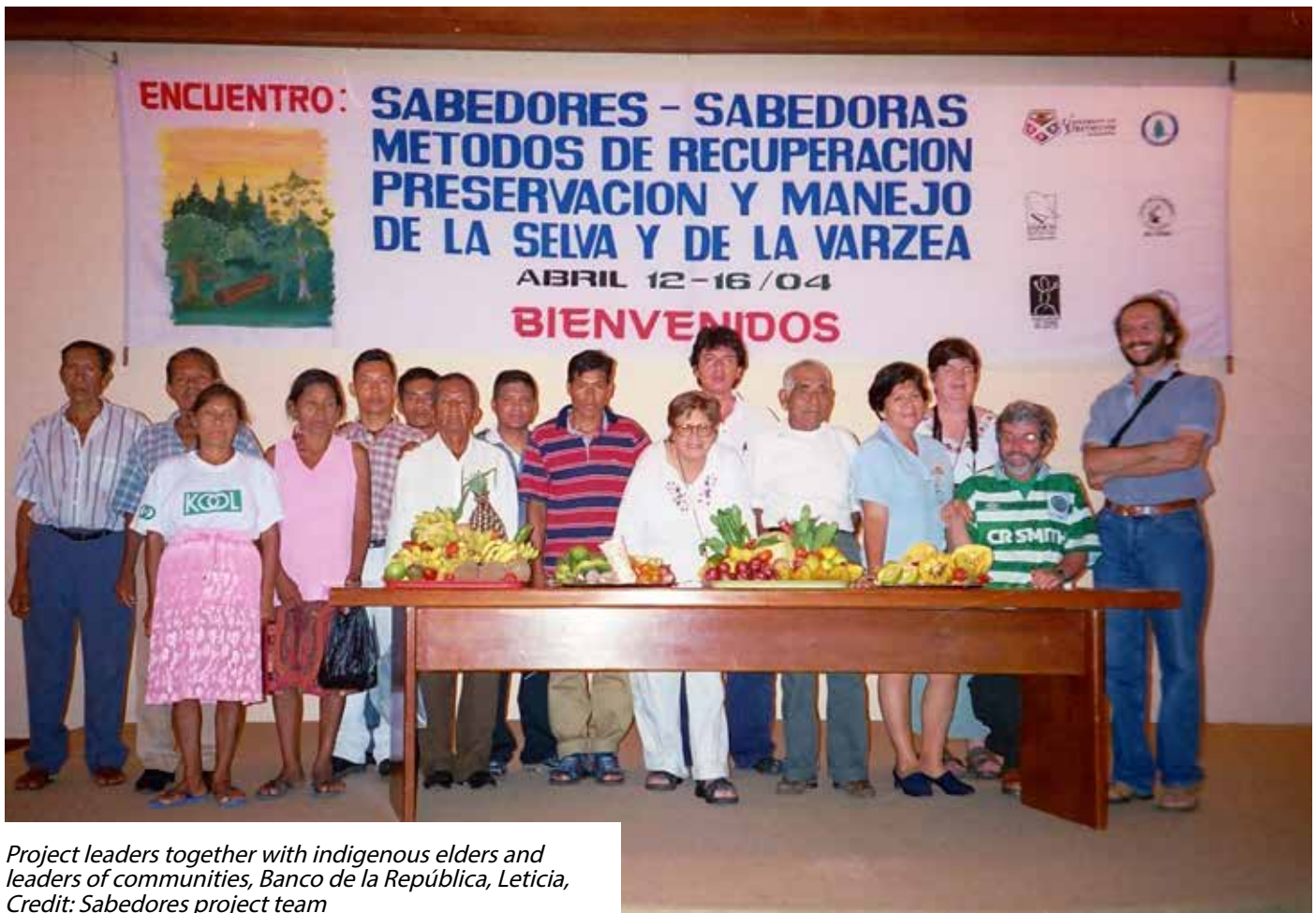
Project leaders together with indigenous elders and leaders of communities, Banco de la República, Leticia

traditional knowledge of healing plants, planting of medicinal plant gardens and traditional education projects within communities.