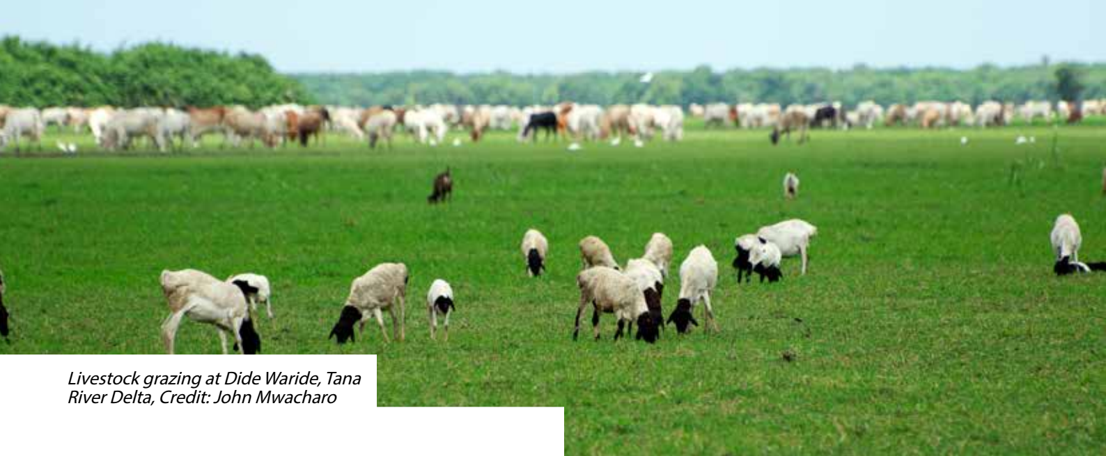
Livestock grazing at Dide Waride, Tana River Delta