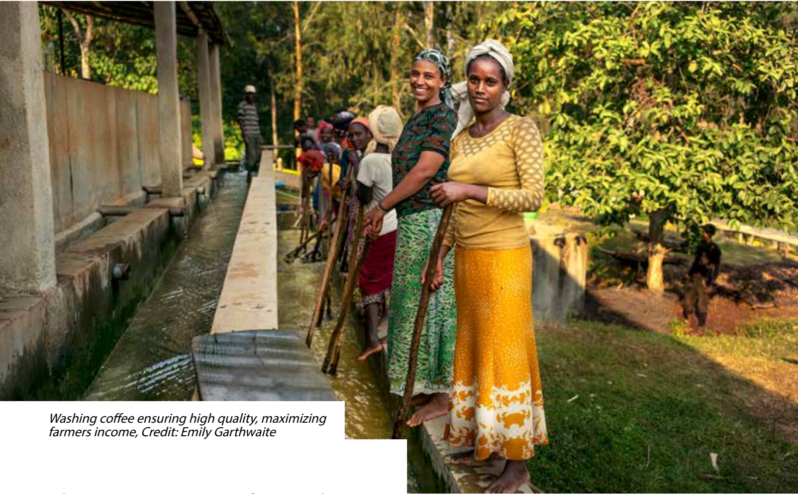
Washing coffee ensuring high quality, maximizing farmers income, Credit: Emily Garthwaite