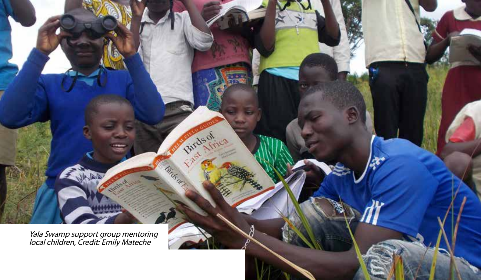
Yala Swamp support group mentoring local children