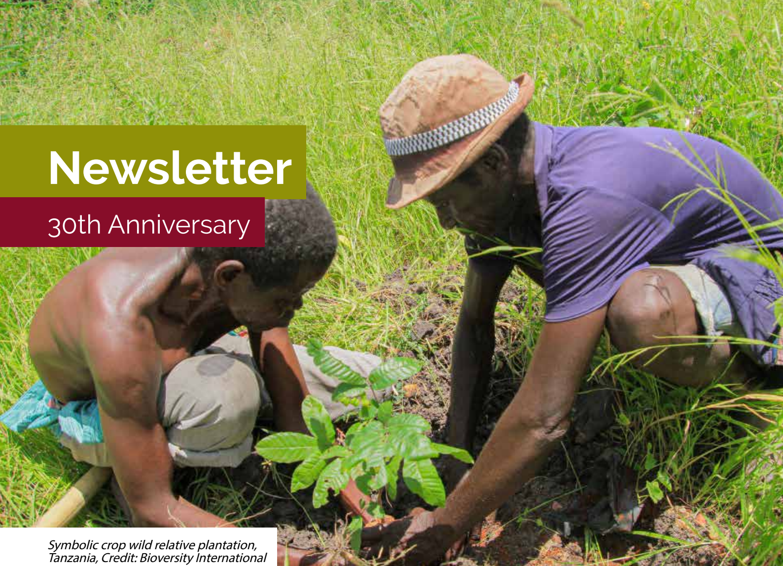
Symbolic crop wild relative plantation, Tanzania, Credit: Bioversity International