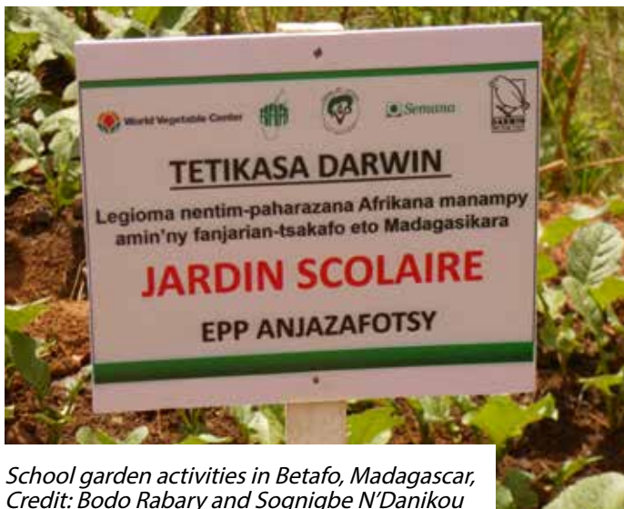
School garden activities in Betafo, Madagascar

“ The project showed that promoting these vegetables in Madagascar through participatory evaluation and linking women farmers to markets provides a great opportunity for female empowerment leading to more vegetable production and income generation for households, as well as increased vegetable consumption in the communities ”