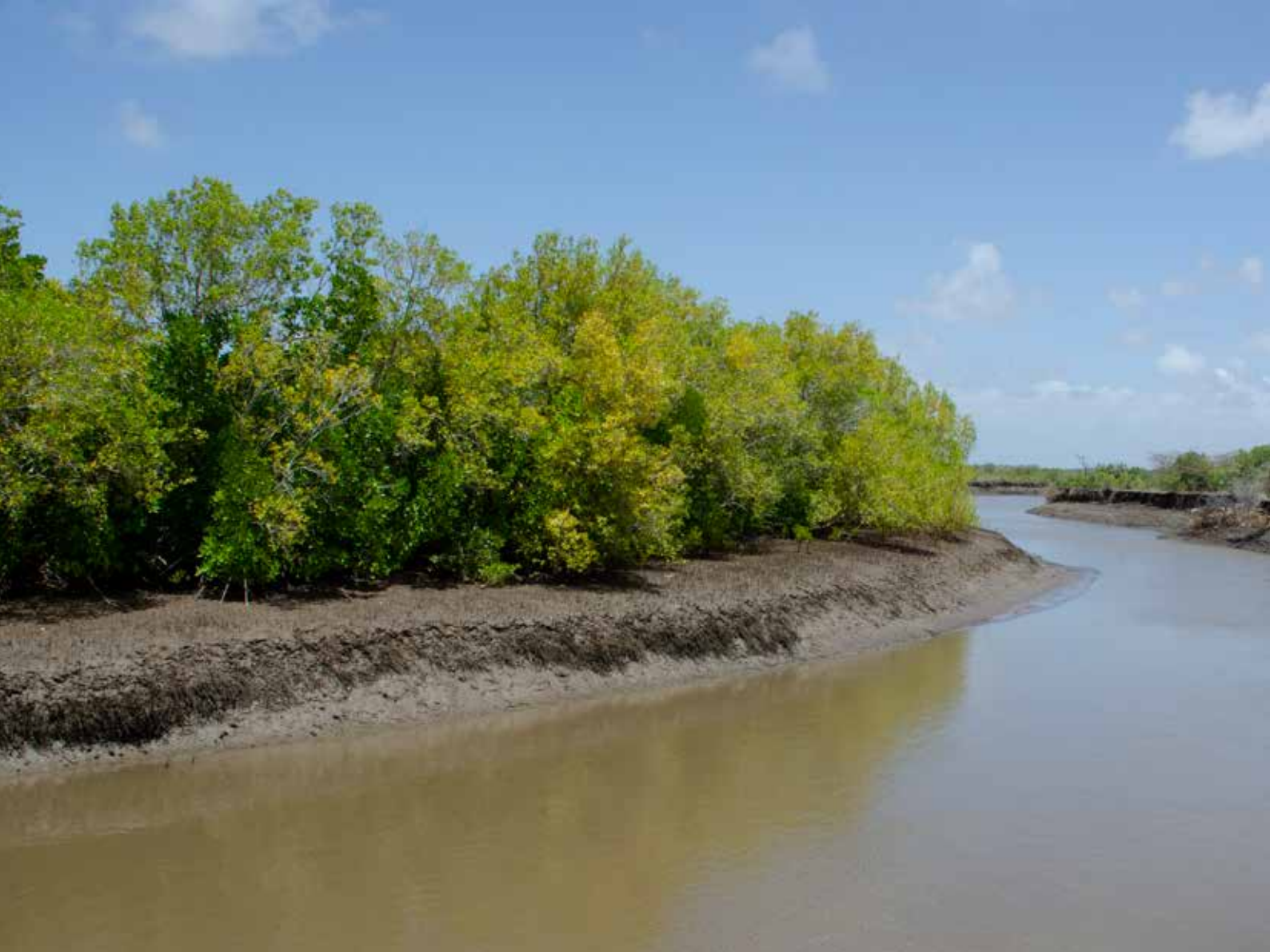
A section of the Tana River Delta