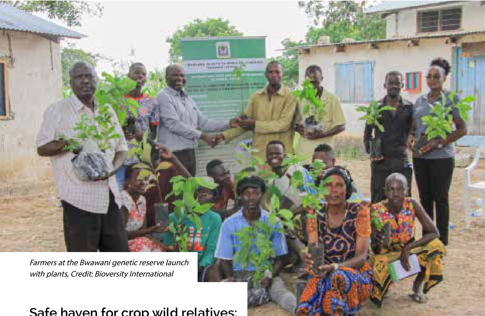
Farmers at the Bwawani genetic reserve launch with plants, Credit: Bioversity International