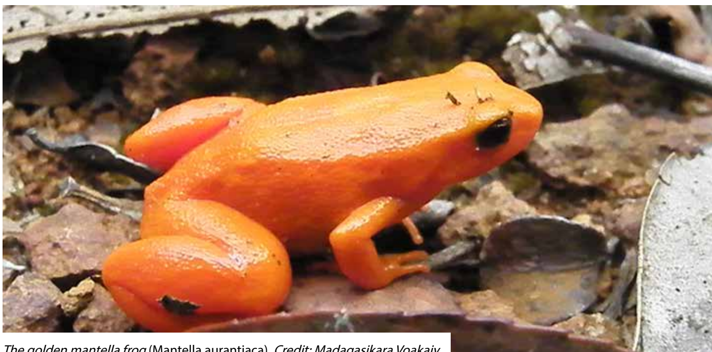
The golden mantella frog (Mantella aurantiaca)