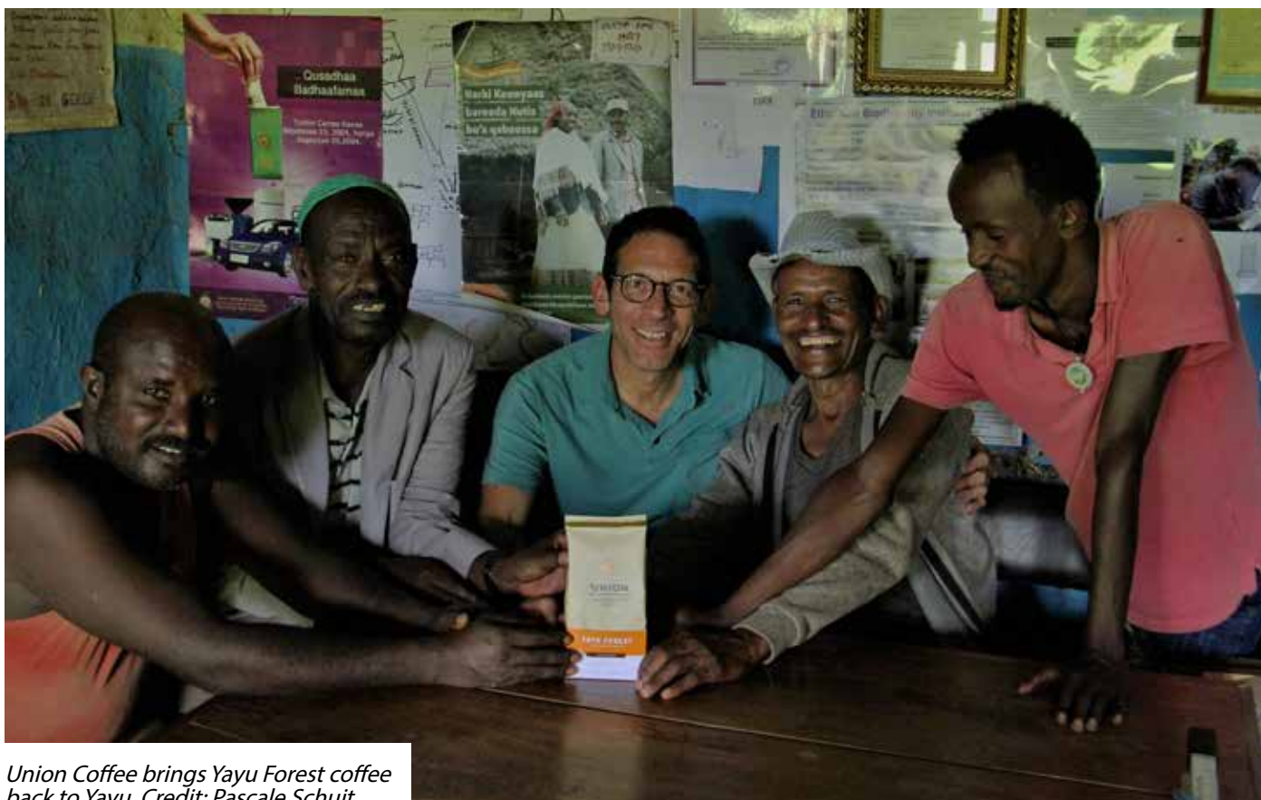
Union Coffee brings Yayu Forest coffee back to Yayu

The legacy of the Darwin Initiative funded Yayu coffee project continues to this day. Yayu Forest coffee is still being purchased at scale from the project area by Union Hand-Roasted Coffee. Since 2015, Union Coffee have purchased 310,000 kg of coffee from Yayu, which amounts to paying the coffee producing community around $(USD) 2 million.