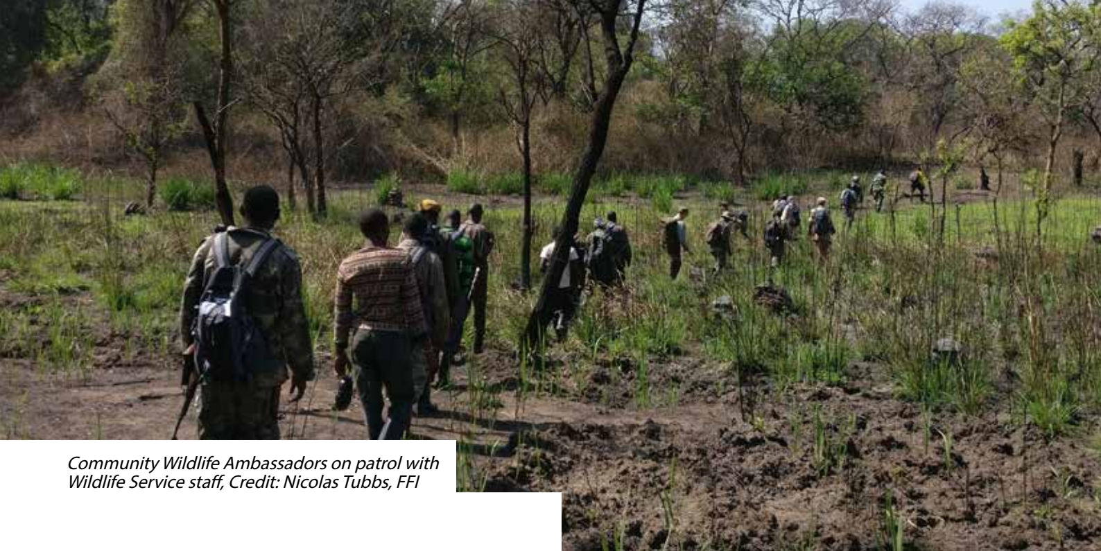
Community Wildlife Ambassadors on patrol with Wildlife Service staff