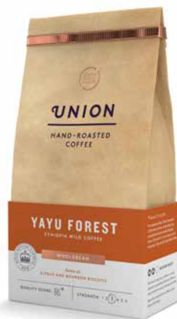
Yayu coffee sold in Waitrose

Yayu Forest coffee is now available in over 600 stores (Sainsbury's and Waitrose) throughout the UK and is available for purchase on the Union Roasted website , and in 2022 it