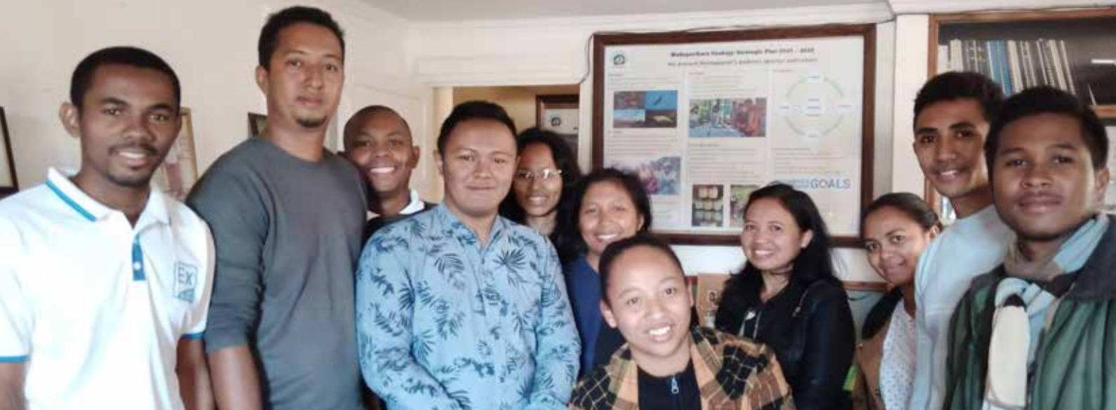
Traditional African vegetables under participatory evaluation, in Anjazafotsy Betafo, Madagascar, Credit: Bodo Rabary and Sognigbe N'Danikou