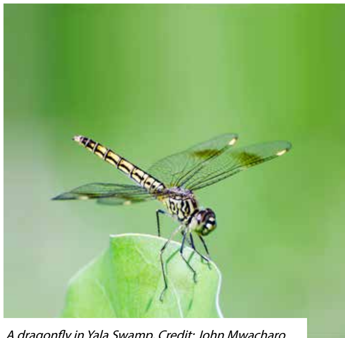
A dragonfly in Yala Swamp

Through both collective and individual efforts like Ndira's, a total of 150ha of degraded area within the Yala Swamp ICCA was restored through direct papyrus planting. Another 183ha of the River Yala riparian zone was restored through the planting of 182,577 indigenous tree seedlings and 171ha (170,917 exotic tree seedlings) of on farm woodlots were established. Management guidelines were applied to promote natural regeneration of papyrus in 200ha of degraded areas within Yala Swamp and 200ha of riverine vegetation within the River Yala riparian zone, thus ensuring protection of the ICCA.