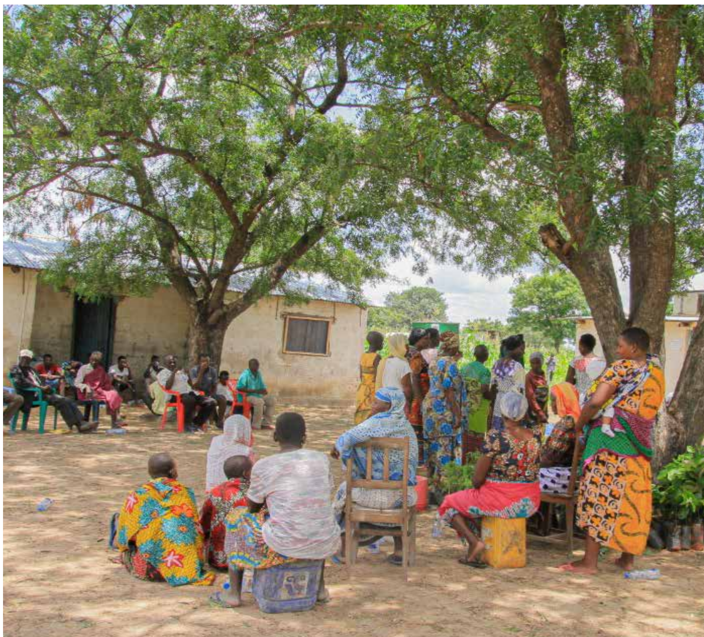
Participants at the Bwawani genetic reserve launch