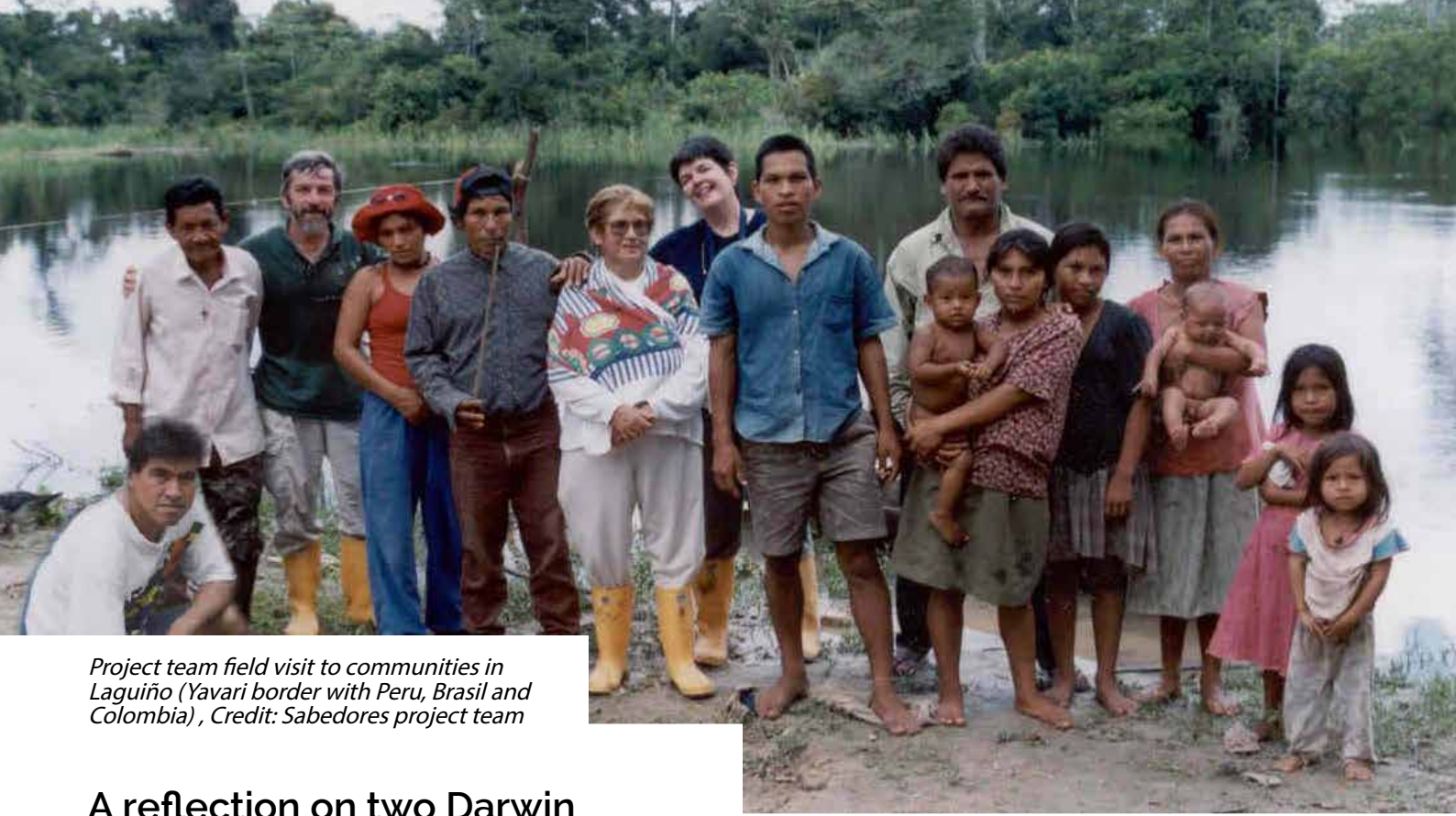
Project team field visit to communities in Laguiño (Yavari border with Peru, Brasil and Colombia), Credit: Sabedores project team